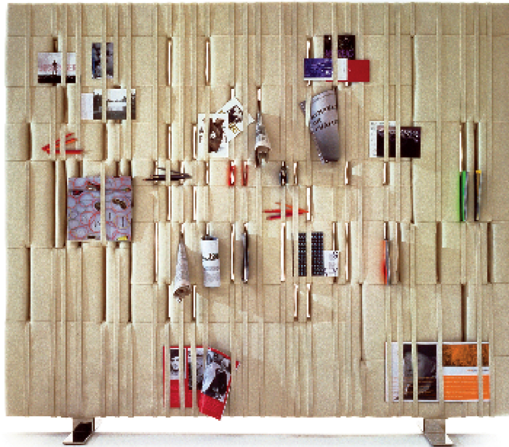
'Soft Wall' by Gerhards and Glucker